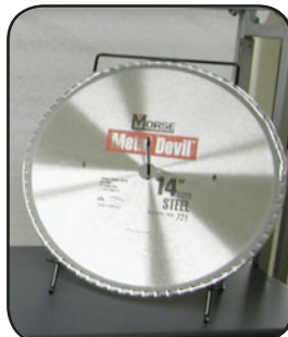
Large Display Rack ABRASACK12-14