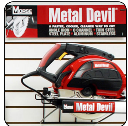
HDRMD622 above CSMRACK (Saw Not Included)